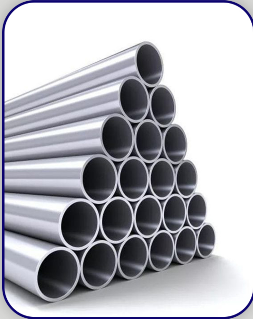
ROUND TUBES / PIPES