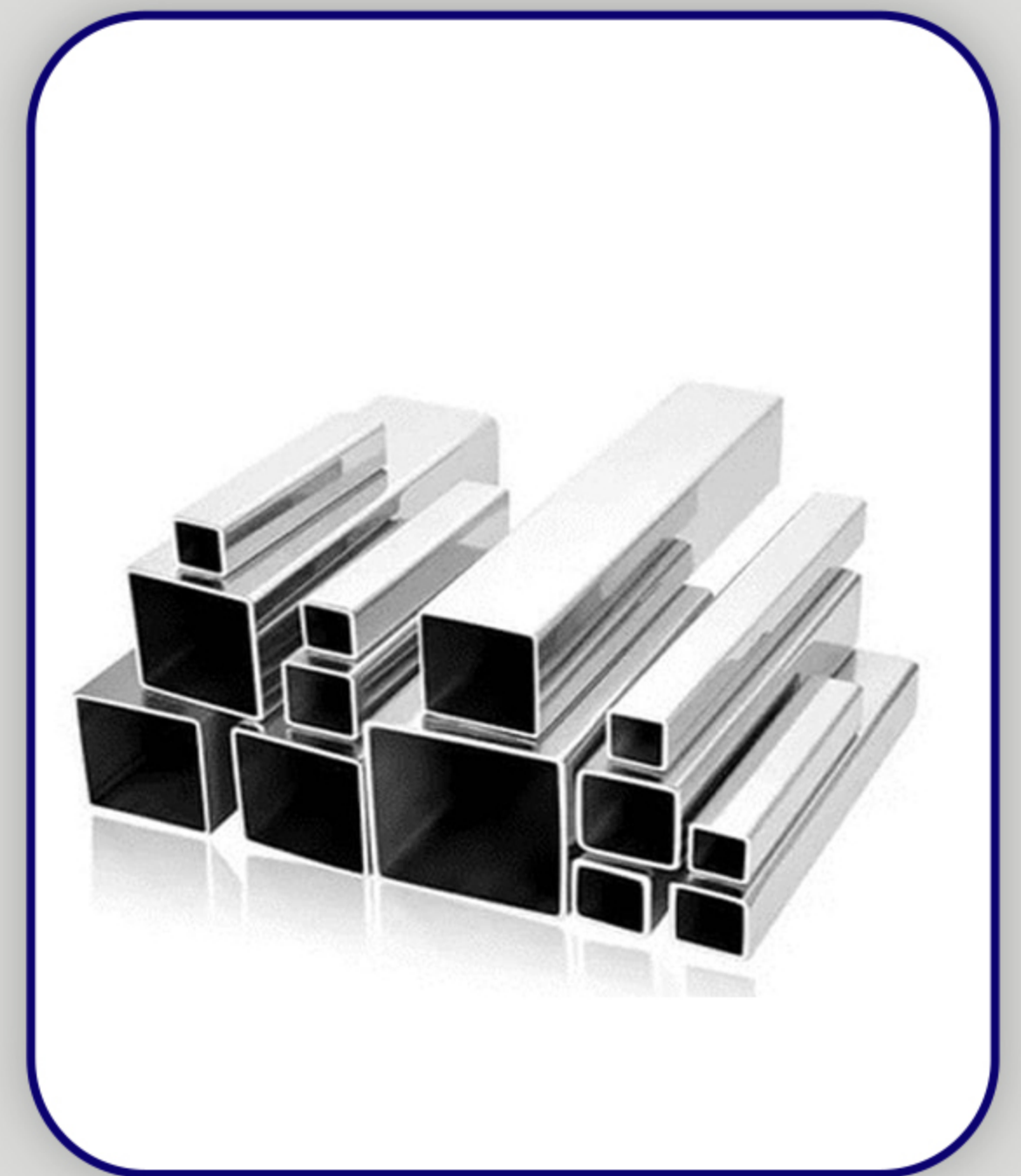
SQUARE TUBES / PIPES