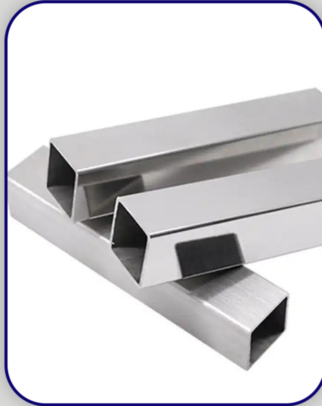
SQUARE TUBES / PIPES