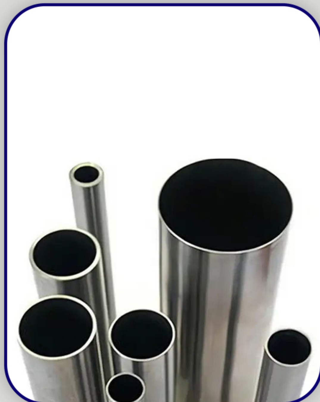
ROUND TUBES / PIPES